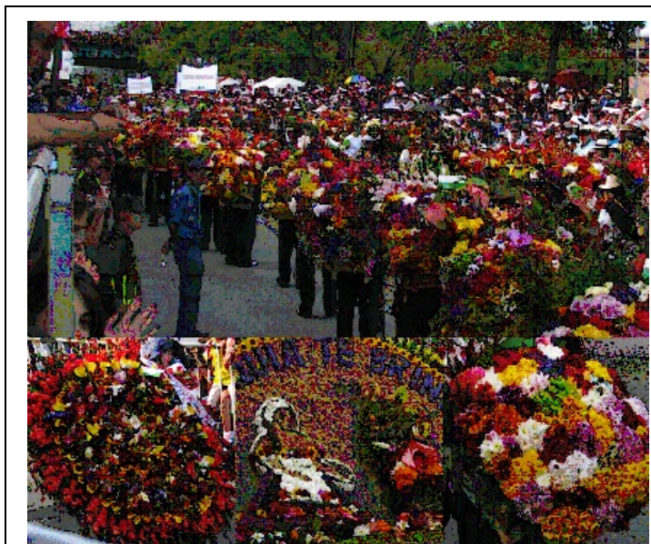
Scenes from the Silleteros' Parade, Medellin.

After several days in and around Medellin, whose museums, flower show, and orchid show should not be missed, we headed south through the Valle de Cauca. We took several days to reach Cali, stopping for hikes and nurseries along the way. The Cauca river occupies a long, fertile valley, where